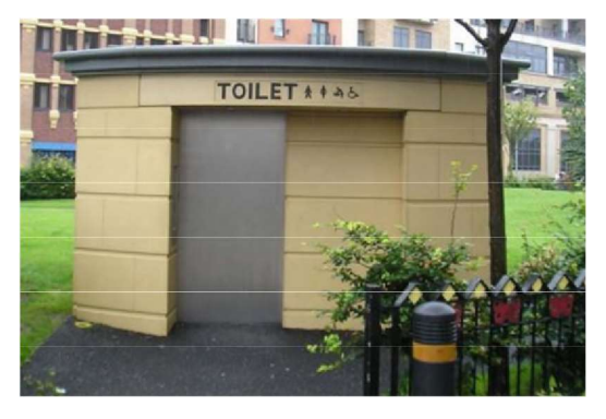
the character of the Fair Green"

"In response to concerns regarding the aesthetic appeal of